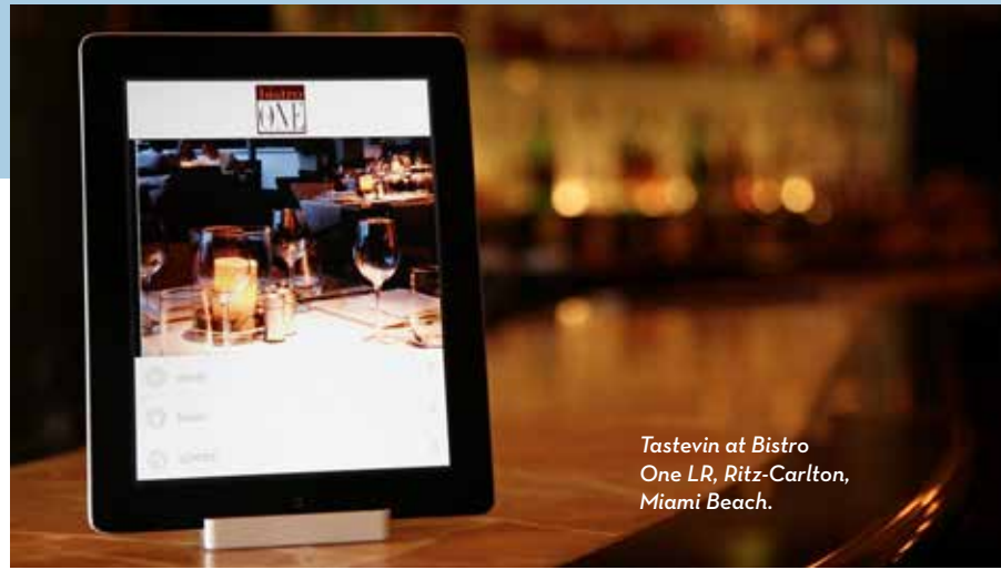
Tastevin at Bistro One LR, Ritz-Carlton, Miami Beach.

TASTEVIN BRINGS BEVERAGE SERVICE INTO THE 21ST CENTURY